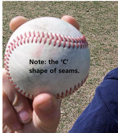
Right: the proper four seam grip features the thumb directly underneath the top two fingers if possible.