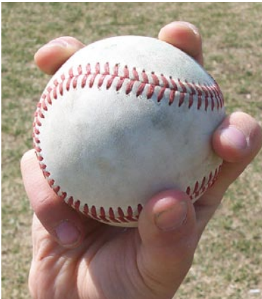
Wrong: many youth players overgrip the ball, causing inconsistent delivery.

The four seam grip is one of the most overlooked and undervalued of all baseball fundamentals. Because without it, it's hard to throw the ball with consistent accuracy. Teaching and monitoring your young players' grips is essential to building solid throwing mechanics.